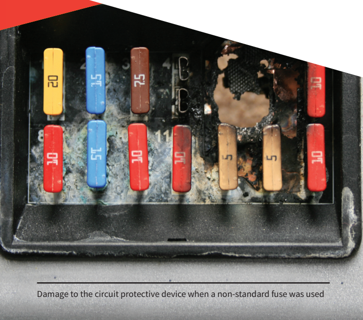
Damage to the circuit protective device when a non-standard fuse was used

Moreover, a full electrical installation check does not form part of the standard annual habitation service, so you have to request this additional work separately.